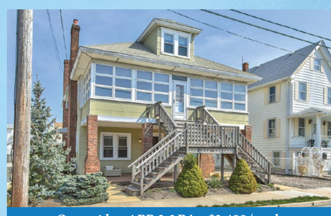
Oceanside - 4 BR 2.5 BA - $2,400/week