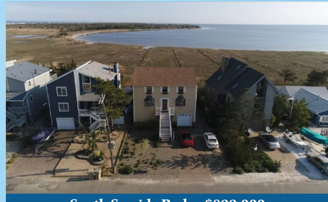
South Seaside Park – $899,000

than this 3BR, 2.5 bath, 2-story gem w/laundry & AC. Rental income is excellent!