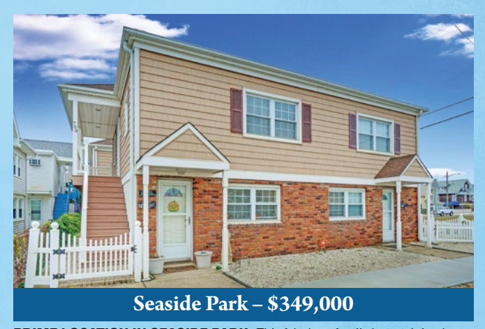
PRIME LOCATION IN SEASIDE PARK. This fabulous family/entertaining home with a sunny gourmet kitchen and large breakfast area that accesses the yard and flows into the living room. Features two over sized bedrooms, one bath with a wonderful family room. The airy second floor landing overlooks your private side and back yard area for entertaining and storage. Don't miss this opportunity to live in one of the most desirable area's of Seaside Park.

THIS PROPERTY IS LOCATED IN A PROMINENT, SECLUDED AREA IN SOUTH SEASIDE PARK. Conveniently located within walking distance of the best restaurants and shops in town. The newly renovated property has beautiful railings, decks, and siding. Balconies provide guest with a perfect relaxation space of their own. This is a perfect unit for anyone to make it their own. Comfortable and spacious living. Deeded parking for convenience.