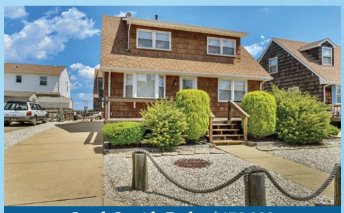
South Seaside Park – $475,000

CHARMING 2 BR 1 BATH DREAM COTTAGES ON ONE PRIME LOT IN SEASIDE PARK! Better than a 2-family, this is a rare opportunity to get income from 2 separate "homes" on a large 50 x 100 lot, or use one & rent one out! Nestled behind a lovely white picket-style fence with a beautiful payer stone front yard is #67 with a gracious entry into a bright, spacious window-enveloped sunroom. Beyond is a light-filled living room, full kitchen w/stainless steel appliances, breakfast bar, stacked washer-dryer & separate entrance, dining room, 2 BRs & bath. A large backyard w/a tented bar & seating areas accommodates outdoor fun. Tucked behind is #65 with a side yard, outdoor shower, wonderful upper wood deck.