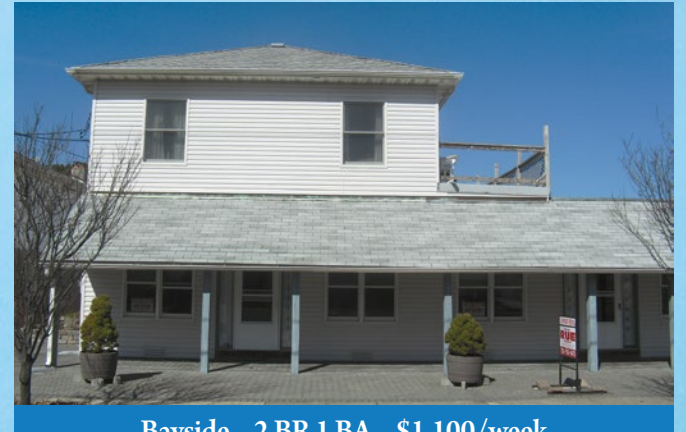
Bayside - 2 BR 1 BA - $1,100/week