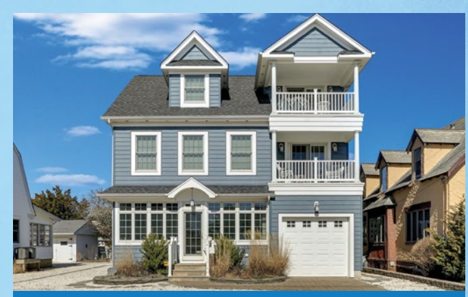
Seaside Park – 5 BR 5BA – Pool – $6,200/week