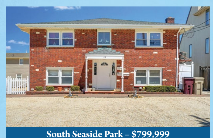
THE VERY BEST OF SOUTH SEASIDE! Enjoy blissful living on a beautiful beach block lined with stunning homes, and a prized location just a block from Island Beach State Park with over 3,000 acres of gorgeous natural coastline! This wonderful 7 bedroom 4 baths in excellent-condition all-brick house is a supreme investment and/or vacation getaway. Other perks of this special property include common laundry, a large & lovely fenced rear paver stone patio for play & entertaining + generous off-street parking. Also mere steps from the pristine sandy ocean beach, fishing & water sports, restaurants & conveniences.