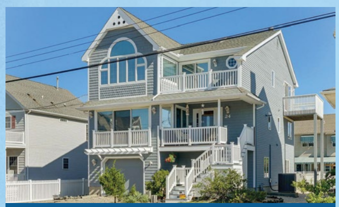
Seaside Park - $1,100,000

BEAUTY BY THE BEACH! Monetti Custom Homes a stone's throw from the ocean, this contemporary 3-story home is a special retreat affording luxury resort living with multiple outdoor spaces, tranquil water views & a light-filled open floor plan that's perfect for entertaining. Host guests or relax with family in the comfortable living/dining rooms & modern kitchen on the 2nd level, which also features convenient powder & laundry rooms. The upstairs master bedroom suite is a quiet haven with a Jacuzzi in the master bath & private balcony with ocean views. Two additional guest BRs & 2 full baths also occupy the 3rd level. The first floor features a generously-sized family room & an in-law suite with a master bath.