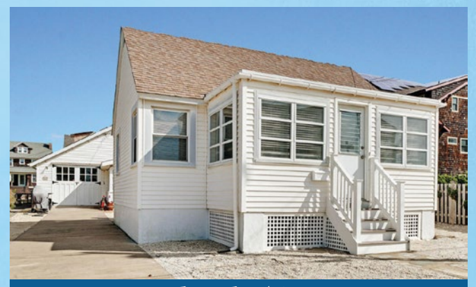
Seaside Park - $699,000

THE OCEAN & THE BAY, BOTH JUST A BLOCK AWAY! Perfect home, vacation getaway or investment on a prime OCEAN BLOCK steps from the beautiful beach. This well-maintained 2-story house w/5 BRs & 2 full baths (including a BR & bath on the 1stfloor) is outstanding for living and/or income. Entertain effortlessly in the open-plan living room, dining room, eat-in kitchen and remodeled family room with a wood-burning fireplace offering plenty of space for all. Hardwood floors, ceiling fans, newer appliances, newer double-insulated windows, nicely tiled baths, an upgraded electrical panel, hot water baseboard heat, a paver stone driveway w/additional on-street parking and an easy access ramp.