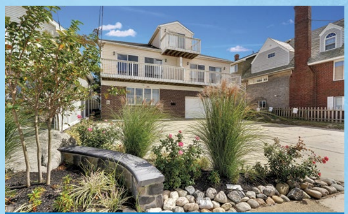
Bayfront - 4 BR 2 BA - $1,050-$3,035/week