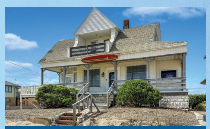
Seaside Park - $1,585,000

HOW SUMMER SHOULD BE! Beautiful beach oasis w/5 BRs, 4.5 baths + rear & side decks! Live the dream in this gorgeous shore home on a spacious lot w/a large patio for sunbathing, barbecues & al fresco dining. A light-filled living room w/classy columns, moldings & color palette sets the tone for entertaining. Also on the main level is a sunny den, open stainless steel/granite kitchen, dining area, BR suite, laundry rm w/sep entrance & powder room. Hardwood floors w/mahogany inlay enrich the ambiance. A sun-bathed king-size master suite w/a soaring sitting room, walk-in closet & spa bath + 2 guest BRs & a full bath occupy the 2nd level. Perched on the 3rd floor is another elegant BR suite w/a wet bar.