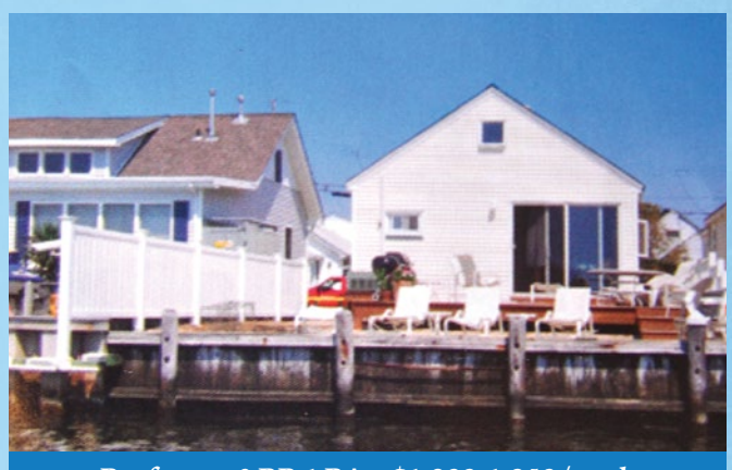
Bayfront - 3 BR 1 BA - $1,800-1,950/week