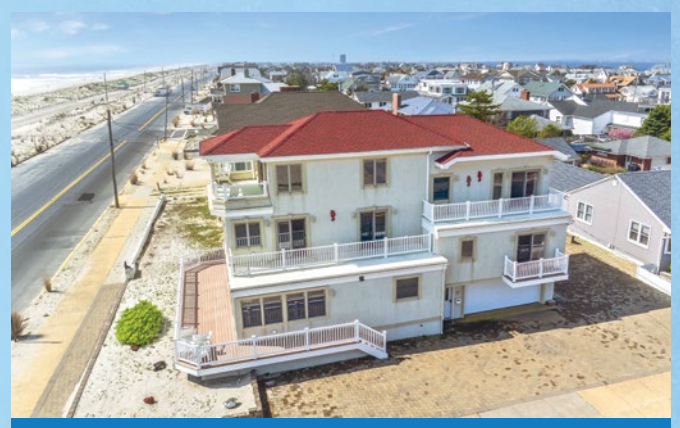
Oceanfront - 5 BR 3 BA - $4,500-$8,000/week