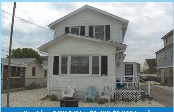
Bayside - 3 BR 2 BA - $1,400-$1,850/week