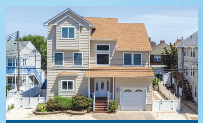
Seaside Park - $1,480,000

THIS FABULOUS 2-FAMILY OCEANFRONT HAVEN OFFERS PERFECT SHORE LIVING RIGHT ACROSS THE STREET FROM THE BEACH. whether you enjoy one unit yourself for the ultimate getaway or rent both out for optimal income! Featuring a wonderful large covered wrap front porch overlooking the sand & water, a deck & huge private yard for outdoor fun plus a 1-car garage! The expansive owners unit presents beautiful open living quarters on the 1st level w/hardwood floors & high ceilings, a fireside living room, formal dining room, lovely eat-in cook's kitchen with stainless steel appliances & an enclosed sun porch, as well as 5 bedrooms & 2 baths upstairs.