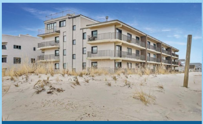
South Seaside Park - $549,000

DON'T MISS THIS CHARMING OCEAN BLOCK HOME, a true diamond in the rough! This three BR, 2 Bath.Cape Cod style home is situated on a 50x100 lot.steps to the Brighton Avenue beach entrance. Formal living room, eat-in kitchen, large family room with wood burning fireplace, laundry room, and hardwood floors. Central air, FHA heat, off-street parking, and rear yard perfect for entertaining. Bring your paintbrush and do minor updating, your architect for major renovation, or your builder to create a new home.