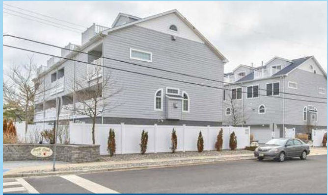
South Seaside Park - $629,000

ENJOY WATERFRONT DREAM LIVING in this an expansive 5 bedroom 2 bath Shore Colonial set on a desirable 71x70 corner bay-front lot. With a large, lovely enclosed porch & an outdoor deck off 2 of the upper BRs where you can savor water views, you'll never want to leave! Head out for a fun-filled nautical day & dock your boat steps away. This light-bathed home showcases water vistas from both generously-sized levels. The ambience is perfect for relaxing or entertaining with a spacious living room with wood floors & picture windows, and a fully-equipped eat-in kitchen with glass slider doors to the fenced yard. One BR is located on the main level while 4 others sit upstairs. Plus central air, great storage.