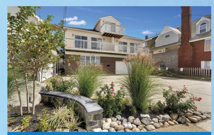
Bayfront - 3 BR 2 BA - $1,350-$2,075/week