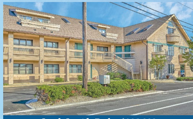
South Seaside Park – $385,000

THIS PROPERTY IS LOCATED IN A PROMINENT, SECLUDED AREA IN SOUTH SEASIDE PARK. Conveniently located within walking distance of the best restaurants and shops in town. The newly renovated property has beautiful railings, decks, and siding. Balconies provide guest with a perfect relaxation space of their own. This is a perfect unit for anyone to make it their own. Comfortable and spacious living. Deeded parking for convenience.