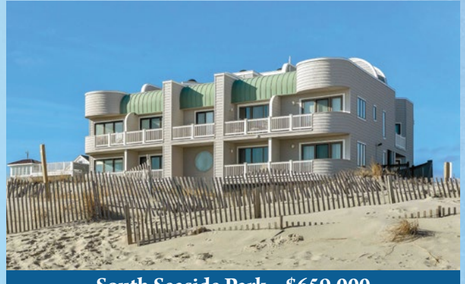
South Seaside Park - $659,000

ENCOUNTER THE ELEMENTS OF STYLE. Perfectly located between Island State Beach Park and Seaside Park. Enjoy One Half Mile of Beaches. Immerse yourself in a world where luxury and elite vacationing co-exist naturally. South Beach. Premium bayside end unit with 3BR's,4 full baths with cherry and granite vanities. Huge garage and utility/fover area,4 fiberglass decks, outdoor patio with privacy fence, 3 zoned heat/air, central vac. syst.gas FP in living room and entertainment room, and much more!