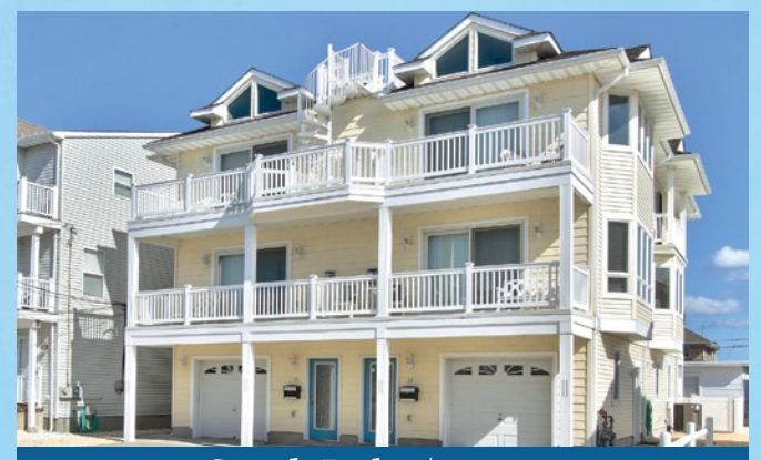
Seaside Park - $709,000

WONDERFUL WATERFRONT SHORE COLONIAL RETREAT on a prime oversized bay-front lot, overlooking stunning sunsets & waiting for you to enjoy it to the fullest! Boasting 12 large rooms with 4 bedrooms & 2 full baths, this is the one you, Äôve been dreaming of for comfortable upscale living & vacationing. Upper & lower decks facing the water afford the ultimate outdoor serenity, as does a huge backyard that has plenty of room to park your boat. Beautiful woodwork, wood floors, an exposed brick fireplace, spacious living & dining rooms, a lightfilled eat-in kitchen, upstairs family room, lovely sunroom, convenient laundry, generous closet space & 4-car garage are among the many bonuses.