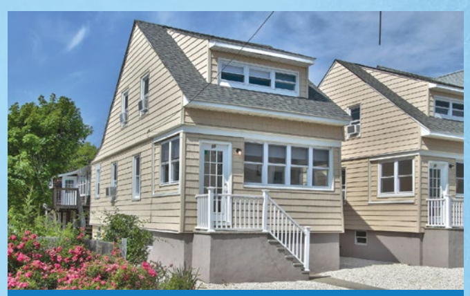
Oceanside – 2 BR 1 BA – $1,000-$1,525/week