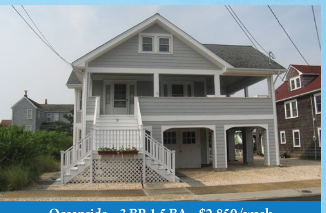
Oceanside – 3 BR 1.5 BA – $2,850/week