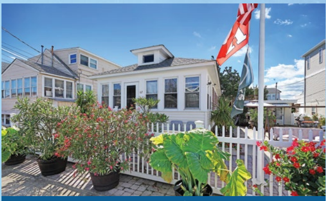
Seaside Park - $539,000

SPACIOUS 3 STORY TOWNHOUSE, minutes to the ocean & bay! Great for summer getaways or rental income! The roof, siding, windows, furnace, CAC, water heater, pool & landscaping were recently replaced/updated! This great-condition home features generous living space & 2 outdoor decks. The 1st flr has an oversized 2-car garage, utilities & shower room for washing off after the beach. The 2nd flr is perfect for relaxing & entertaining with a light-filled living room, kitchen & open dining area accessing the private deck w/storage. A laundry rm & powder rm are also on this level. Two BR suites w/walk-in closets & full baths sit on the 3rd flr. The master has slider doors to a private deck w/a partial bay view.