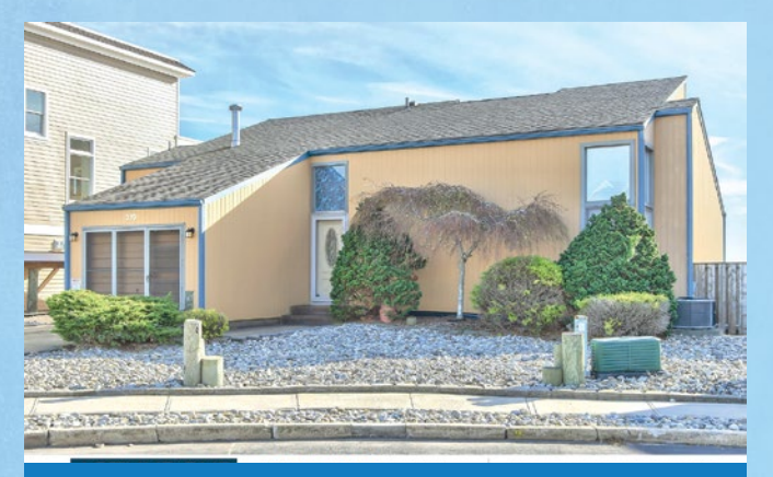
Bayfront – 4 BR 2 BA – $3,000/week