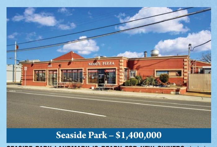
SEASIDE PARK LANDMARK IS READY FOR NEW OWNERS. Includes spacious living quarters. Amazing opportunity for an investor and/or business operator on a prime ocean block and double corner lot in sought-after Seaside Park! In addition to a large well-maintained, fully-operating turnkey pizzeria restaurant, this 10,000 square foot property also currently houses 2 very nice and spacious

OCEANFRONT GEM! A large, breezy, covered open wraparound front porch overlooking the ocean sets a perfect vacation tone at this spacious 3,000+/- sq ft Dutch Colonial home on an oversized oceanfront lot (50x125)! Sip a coffee or cocktail while gazing at the beach right across the way, or mingle with guests facing unobstructed views of blue sky, sand & the glistening water. The locale is premier and the interior is bright & gracious with lots of possibilities, awaiting your customization. A dining room, eat-in kitchen, family room, 2 BRs, full bath & laundry occupy the 1st level. On the 2nd level sits a big living/dining combo leading out to the peaceful porch, a den, master bedroom, 2 guest bedrooms.