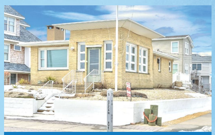
Oceanfront - 3 BR 1.5 BA - $1,000-$3,000/week