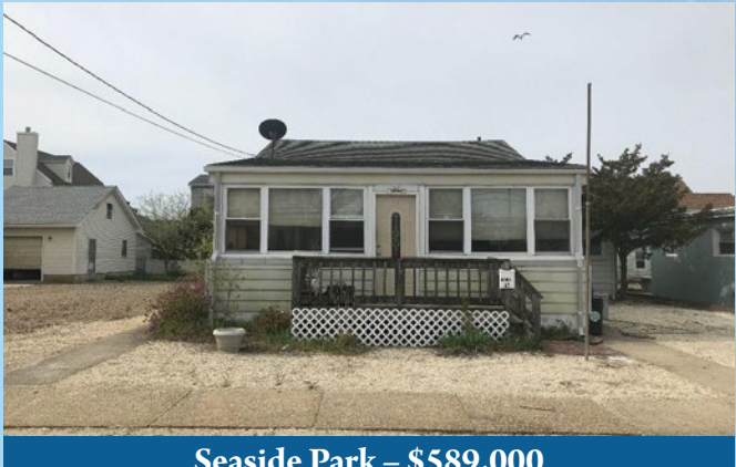
Seaside Park - $589,000

BUILD YOUR DREAM HOME STEPS FROM THE OCEAN AND THE POPULAR 2ND AVENUE BEACH! What an excellent opportunity for you to own a perfectly-located 50 x 100 lot on a prime ocean block in Seaside Park. Imagine the joy of your own custom shore home, and the incredible rental potential in such an amazing spot.