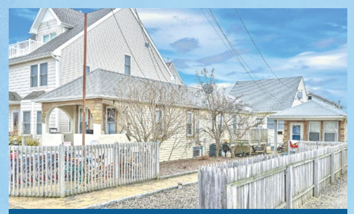
Seaside Park - $387,500

AN INVESTOR'S DREAM IN SEASIDE PARK! This immaculate income-producing property with three spacious units sits in an ultra-desirable location just steps to the beach. All units are currently rented on an annual basis, generating a yearly gross income of $32,400. Each unit conveniently has a separate utility meter and features bright, comfortable living space a stone's throw from the water. The exterior of the home is meticulously maintained with outdoor areas for relaxing with coffee, storing bikes, etc., as well as off-street parking. All units have central air and natural gas. The prime location is close to the bay, the ocean, as well as stores and restaurants.