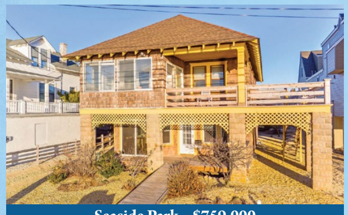
Seaside Park - $759,000

WONDERFUL WATERFRONT SHORE COLONIAL RETREAT on a prime oversized bay-front lot, overlooking stunning sunsets & waiting for you to enjoy it to the fullest! Boasting 12 large rooms with 4 bedrooms & 2 full baths, this is the one you, Äôve been dreaming of for comfortable upscale living & vacationing. Upper & lower decks facing the water afford the ultimate outdoor serenity, as does a huge backyard that has plenty of room to park your boat. Beautiful woodwork, wood floors, an exposed brick fireplace, spacious living & dining rooms, a lightfilled eat-in kitchen, upstairs family room, lovely sunroom, convenient laundry, generous closet space & 4-car garage are among the many bonuses.