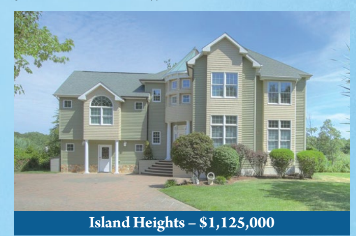
BREATHTAKING INSIDE & OUT! This spectacular waterfront estate with a private iron gated entry is a rare gem in exclusive Island Heights on Dillon's Creek. Exquisite grounds, stunning views & luxurious living space reflect utmost elegance in a prized locale, complemented by a protected waterway & private dock for 40'-50' vessels. The marble fover introduces a meticulously-designed interior with gorgeous light-filled rooms. A dramatic living room boasts 27' ceilings, a fireplace flanked by glass, gleaming hardwood floors & impeccable details. The formal dining room & designer granite/stainless kitchen make entertaining seamless & stylish. A library, great room w/granite 1/2 bath, master suite w/European-inspired spa.

A MAJESTIC OCEAN BLOCK HOME, built in 2005 but still like new w/ stretching decks, a private fenced patio/vard & 3 stories of stunning sun-bathed living quarters. Your contemporary paradise by the beach awaits, with a luxurious interior graced by a bright & beautiful open-plan LR/DR/gourmet kitchen on the spacious main level. Comfortable accommodations also include a lovely window-surrounded reading room & 1st floor BR suite, 2 large 2nd floor BRs & a sumptuous 3rd floor master suite with an incredible walk-in closet & spa bath with a bay view, Jacuzzi tub, glass-enclosed shower, double vanity. Hardwood floors, granite counters, stainless steel appliances, a center island, oversized windows.