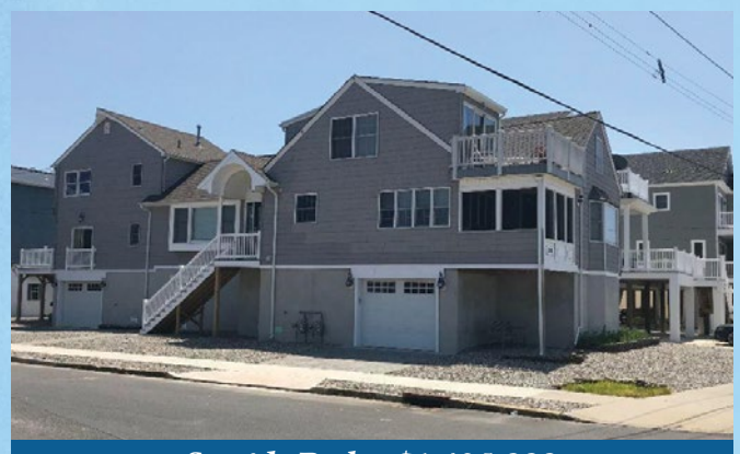
Seaside Park - $1,425,000

THIS BRAND-NEW-CONDITION, extensively renovated 5 bedroom 3.5 bath waterfront home with a rare 2nd legal rental unit is truly one of a kind, on a prime oversized lot with phenomenal views of the bay! Rent out both, or live in one and rent the 1BR space for year-round income! The beautiful main residence featuring 5 BRs & 3.5 baths is comfortable for relaxing with loved ones & has plenty of room for entertaining guests with a large gourmet kitchen, family room with a wet bar & gas fireplace + 2nd living area where you can play games or sit & chat. A mudroom with washer & dryer, 2 upper level master suites, big yard & more! Enjoy stunning sunsets from the open air upper deck or enclosed screened porch.