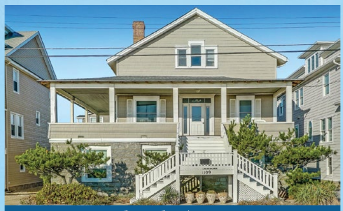
Seaside Park - $1,400,000

THIS BRAND-NEW-CONDITION, extensively renovated 5 bedroom 3.5 bath waterfront home with a rare 2nd legal rental unit is truly one of a kind, on a prime oversized lot with phenomenal views of the bay! Rent out both, or live in one and rent the 1BR space for year-round income! The beautiful main residence featuring 5 BRs & 3.5 baths is comfortable for relaxing with loved ones & has plenty of room for entertaining guests with a large gourmet kitchen, family room with a wet bar & gas fireplace + 2nd living area where you can play games or sit & chat. A mudroom with washer & dryer, 2 upper level master suites, big yard & more! Enjoy stunning sunsets from the open air upper deck or enclosed screened porch.