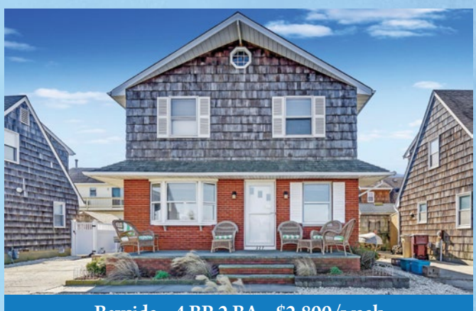
Bayside – 4 BR 2 BA – $2,800/week