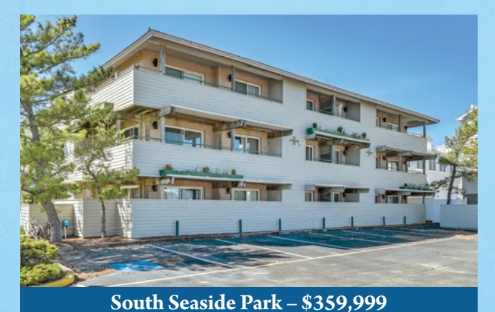
HAVE YOUR BEST SUMMER EVER IN SOUTH SEASIDE PARK! Treat yourself to a fabulous getaway in this beautifully updated 2BR 2 bath Island View condominium near it all, just a block to the beach, 2 blocks to Island Beach State Park & minutes from Barnegat Bay. This large, freshly-painted upper-level unit offers brand new air conditioning, new crown moldings, new doors, a new ceiling fan, new window treatments and sliding doors in the open living & dining room area, new porcelain tiling, and an open kitchen with a center island, new back splash & all new stainless steel appliances (refrigerator, range, microwave oven & dishwasher!). A wonderful private balcony with a barbecue & plenty of room for seating.

AN INVESTOR'S DREAM IN SEASIDE PARK! This immaculate income-producing property with three spacious units sits in an ultra-desirable location just steps to the beach. All units are currently rented on an annual basis, generating a yearly gross income of $32,400. Each unit conveniently has a separate utility meter and features bright, comfortable living space a stone's throw from the water. The exterior of the home is meticulously maintained with outdoor areas for relaxing with coffee, storing bikes, etc., as well as off-street parking. All units have central air and natural gas. The prime location is close to the bay, the ocean, as well as stores and restaurants.