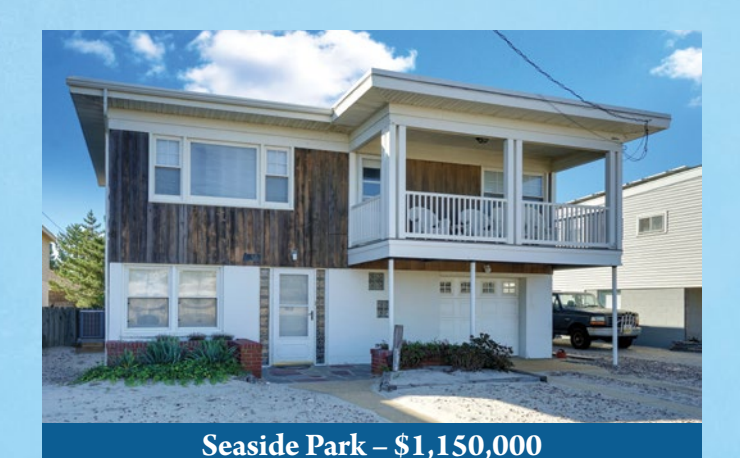
CONTEMPORARY-STYLE BEACHFRONT BEAUTY WITH STUNNING WATER VIEWS, 2 spacious stories, large front & rear decks, and a premier location to fall in love with! A 2-car garage & long driveway provide plenty of space for parking. A generous front yard, huge fenced yard & covered patio area under the upper deck are great for parties, BBQs, sports, kids, pets, lounging & summer fun! A bluestone front entry leads into the rich wood fover area of this 2-story detached single-family home. The wood-paneled living room with a floor-to-ceiling stone surrounded gas fireplace has corner windows overlooking the ocean, as well as an open dining area off the eat-in kitchen. Large bedrooms with water views.