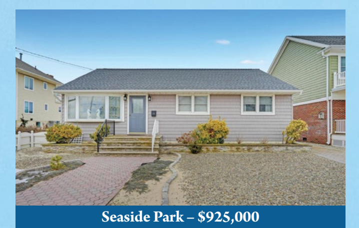
READY TO HIT THE BEACH? Located just 1 house away from the sandy shore is this fabulous vacation getaway or excellent rental for income in prime Seaside Park - perfect for anyone who loves the beach life! Take a stroll on the sand, bathe in the sun or take a dip in the Atlantic Ocean steps from your door! Set on a spacious 50x133 lot in a great neighborhood, this immaculate Cape with a front yard, paver stone driveway & detached 2-car garage offers lots of parking & space for living/entertaining. Host BBQs & parties in the spacious rear paver patio/yard area! A new roof, eat-in kitchen, hardwood floors, large sunny living & dining rooms + huge family/rec room with stone fireplace will make you call this the one!

BEAUTY BY THE BEACH! Monetti Custom Homes a stone's throw from the ocean, this contemporary 3-story home is a special retreat affording luxury resort living with multiple outdoor spaces, tranquil water views & a light-filled open floor plan that's perfect for entertaining. Host guests or relax with family in the comfortable living/dining rooms & modern kitchen on the 2nd level, which also features convenient powder & laundry rooms. The upstairs master bedroom suite is a quiet haven with a Jacuzzi in the master bath & private balcony with ocean views. Two additional guest BRs & 2 full baths also occupy the 3rd level. The first floor features a generously-sized family room & an in-law suite with a master bath.