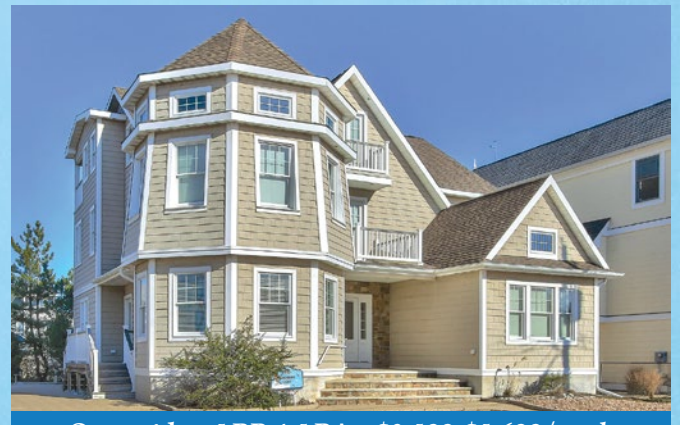
Oceanside - 5 BR 4.5 BA - $3,500-$5,600/week