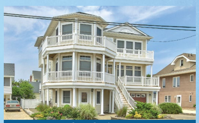
Seaside Park - $1,198,000

A MAJESTIC OCEAN BLOCK HOME, built in 2005 but still like new w/ stretching decks, a private fenced patio/vard & 3 stories of stunning sun-bathed living quarters. Your contemporary paradise by the beach awaits, with a luxurious interior graced by a bright & beautiful open-plan LR/DR/gourmet kitchen on the spacious main level. Comfortable accommodations also include a lovely window-surrounded reading room & 1st floor BR suite, 2 large 2nd floor BRs & a sumptuous 3rd floor master suite with an incredible walk-in closet & spa bath with a bay view, Jacuzzi tub, glass-enclosed shower, double vanity. Hardwood floors, granite counters, stainless steel appliances, a center island, oversized windows.