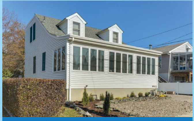
Bayside - 3 BR 2 BA - $1,800-$2,250/week