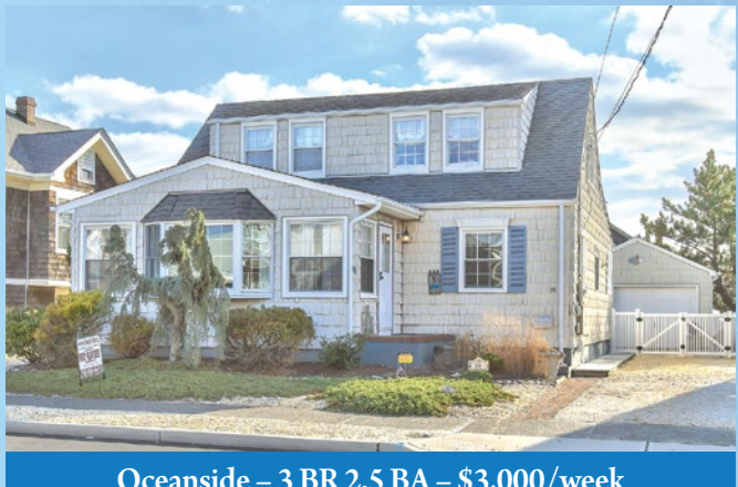
Oceanside - 3 BR 2.5 BA - $3,000/week