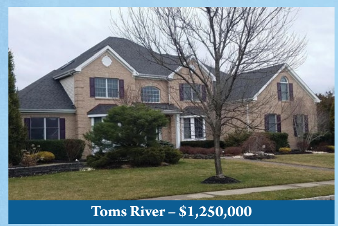
5 BEDROOM 3 & 1/2 BATH. 5900 Sft w/ finished basement. In upcoming exclusive neighborhood. Very private, landscaped.secluded backvard. Country club setting. Plenty of room for gatherings and family affairs. Great room w breathtaking view of vard In-ground saltwater pool, custom closets, finished basement, custom cabinetry. New A/C units. Room to expand and modify to your needs. On street with other multi-million dollar homes. Must See. Serious buyers. See Arial video attached.