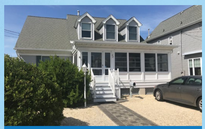
Oceanside – 4 BR 2 BA – Handicap Accessible – $3,000/week